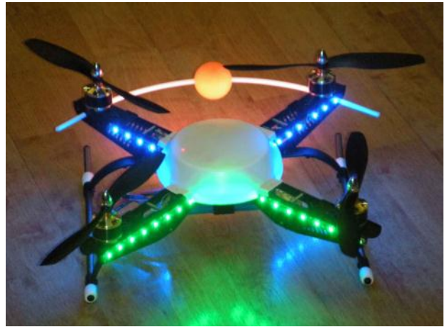
Quad-Flyer with Bob Stroz's Added Lights

The quad-flyer was outfitted with a series of colored LED light strips that produced a dramatic light show when the room was darkened. If nothing else when the aircraft isn't flying it will make a great Christmas tree ornament!!