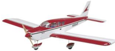
Great Planes Cherokee