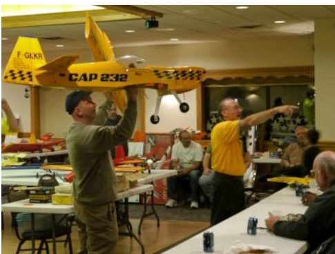
Photos show two of many items offered at the annual SAC auction