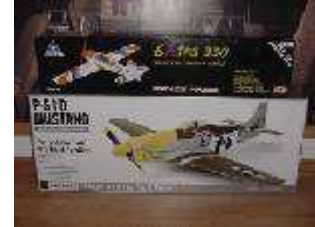
Hangar 9 Electric P51 Mustang