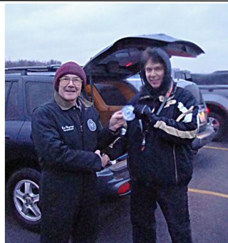
A New Winner for 2012

The weather was iffy, temperatures in the mid 20's, cloudy, windy and, oh yes, begin-