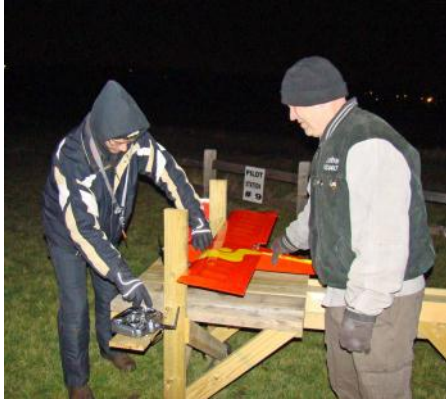
First Flight Contestants (Left and Right) work out frigid-weather engine starts